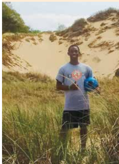
There’s joy on the face of this English Learner student experiencing Lake Michigan for the first time!