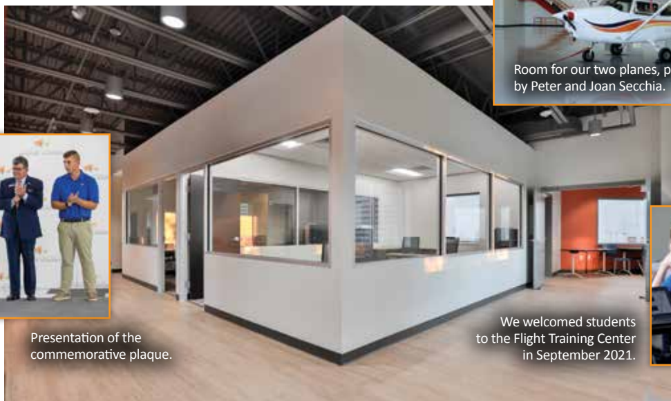
We welcomed students to the Flight Training Center in September 2021.