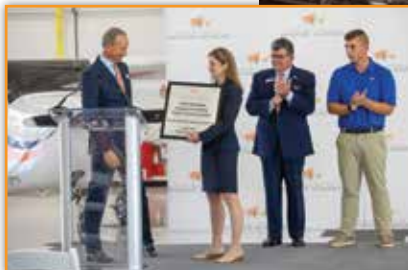
Presentation of the commemorative plaque.